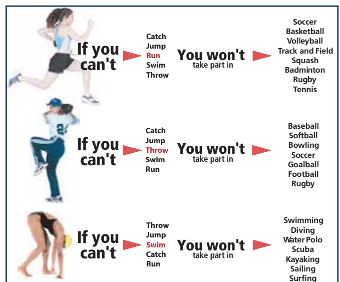
Figure 2 - Fundamental Skills Needed First

To achieve physical literacy, children should experience movement and sport skills in all kinds of indoor or outdoor environments, such as activities in or on the water, on the ground, on ice or snow, at the gym, or at parks and playgrounds.